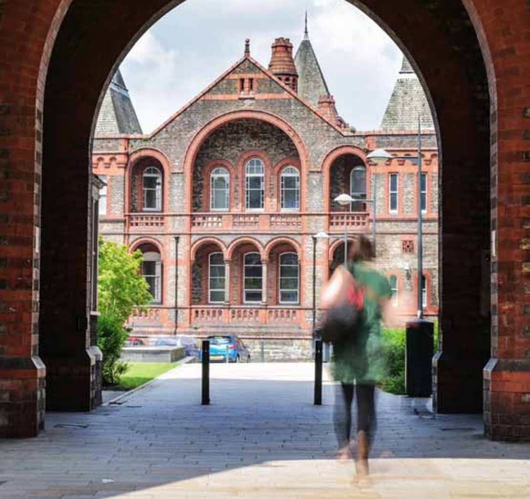
University of Liverpool Thompson Yates Building